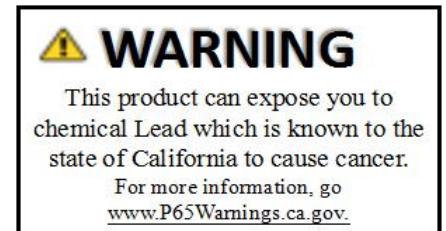
New Label Marker

Official Link: https://oehha.ca.gov/proposition-65/cmr/notice-modification-text-proposed-regulation-proposed-repeal-article-6-and